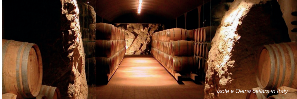
Isole e Olena cellars in Italy