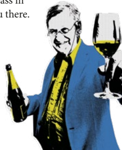
Hugh Johnson OBE, Sunday Times Wine Club President