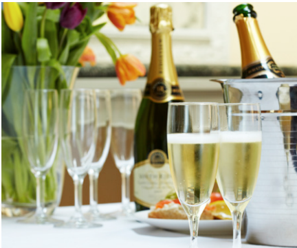
Ice cold fizz – perfect summer drinking!