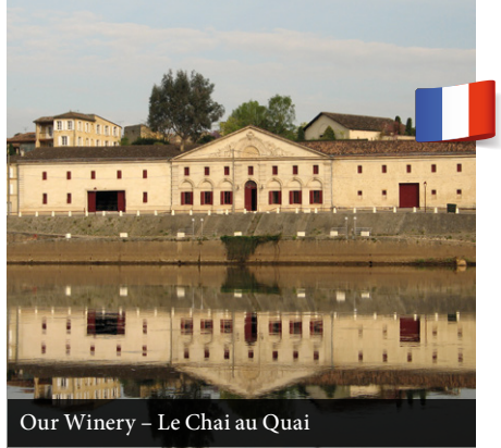
Our Winery – Le Chai au Quai

Stop by table 2 for a taste of Le Chai au Quai – the headquarters for Laithwaite's own production wines situated in Castillon, on the banks of the Dordogne river. With no vineyards, this wine studio has the ultimate freedom to buy in grapes from wherever it chooses. Throughout the years its main objective has remained: always to produce the finest quality at the best, most affordable price.