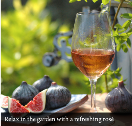
Relax in the garden with a refreshing rosé

Long hot summer days wouldn't be complete without a refreshing glass of rosé and you'll be tickled pink with today's selection including a 5% ABV bubbly – perfect for a leisurely lunch and a classic, pale, crisp exclusive from one of the most innovative estates in southern France.