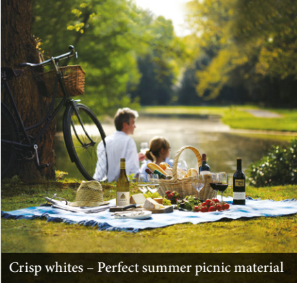
Crisp whites – Perfect summer picnic material

Set yourself up for summer with a pristine glass of Picpoul de Pinet listed in the top 100 wines of Southern France. We've also got an intensely refreshing Sauvignon from one of the top spots in Marlborough and a seriously fruity Chenin Blanc.