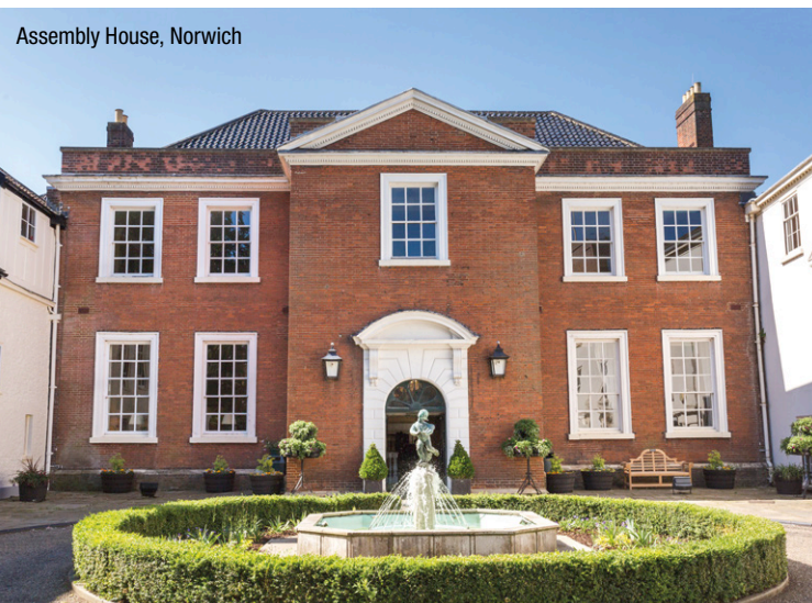
Assembly House, Norwich