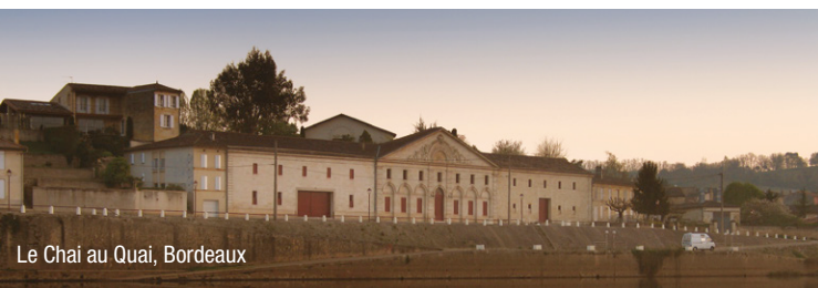
Le Chai au Quai, Bordeaux