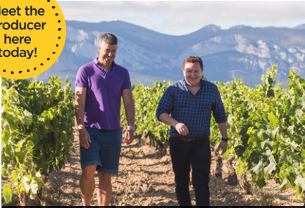
The Vineyards at Bodegas Muriel