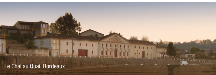
Le Chai au Quai, Bordeaux