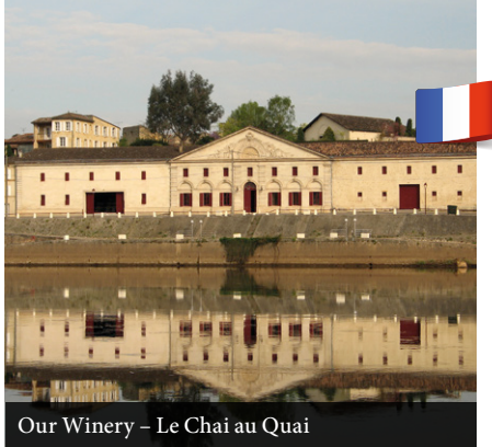
Table 2. Le Chai au Quai, France

Stop by table 2 for a taste of Le Chai au Quai – the headquarters for Laithwaite’s own production wines situated in Castillon, on the banks of the Dordogne river. With no vineyards, this wine studio has the ultimate freedom to buy in grapes from wherever it chooses. Throughout the years its main objective has remained: always to produce the finest quality at the best, most affordable price.