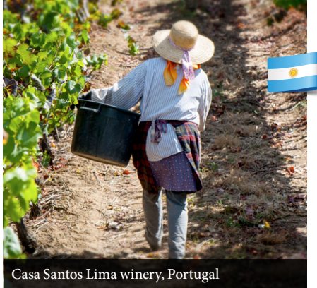
Casa Santos Lima winery, Portugal