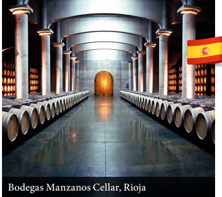
Bodegas Manzanos Cellar, Rioja