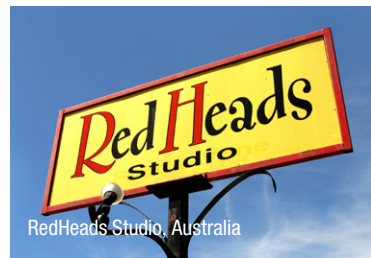
RedHeads Studio, Australia