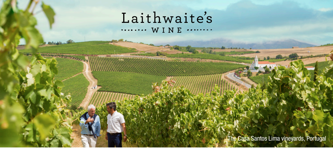
The Casa Santos Lima vineyards, Portugal